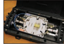
Single Fusion Splice Applications