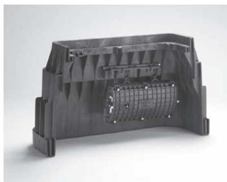
Universal Hand Hole Mount