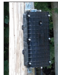
Pole/Wall Mount Bracket