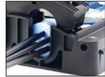
End Plate Installation