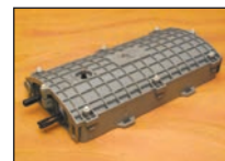
COYOTE Flame Retardant In-Line RUNT