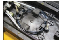
Installed Fiber Organizer for Ribbon