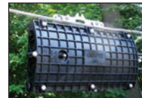
Aerial Strand Mount Bracket