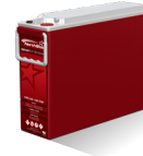
NSB 100FT HT RED