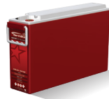
NSB 190FT HT RED